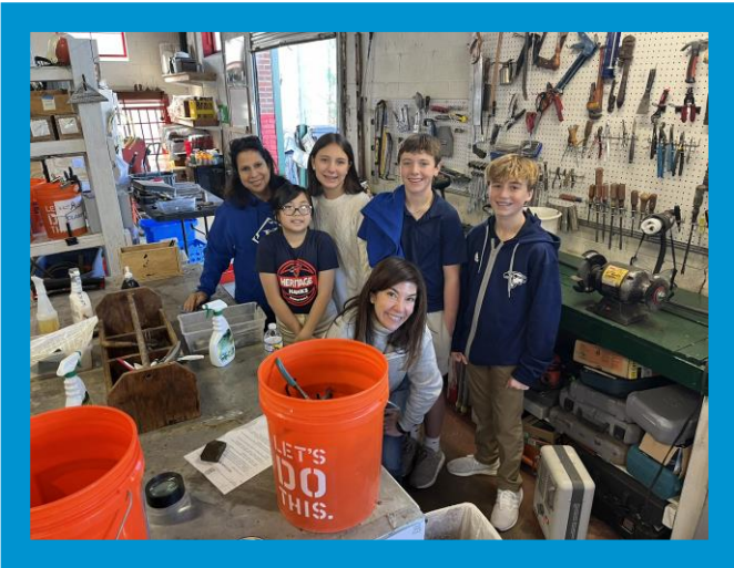
Volunteers from The Heritage School!