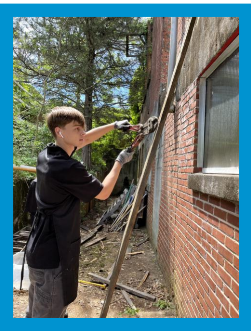
“Volunteers salvage donated wood to make tool crates for shipping.”